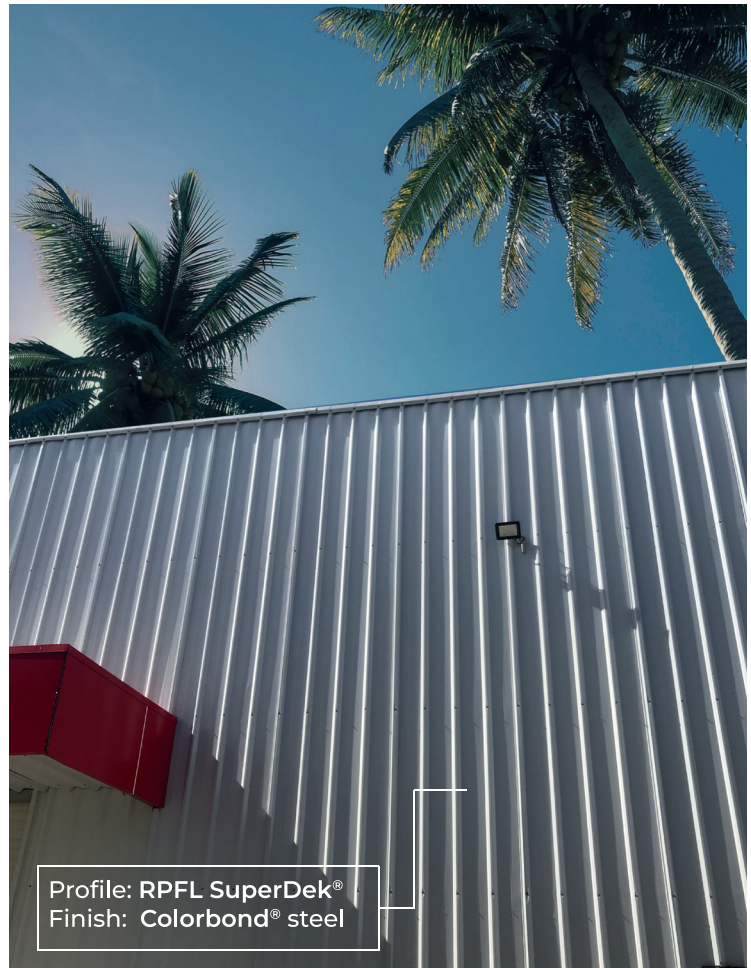
Profile: RPFL SuperDek® Finish: Colorbond® steel