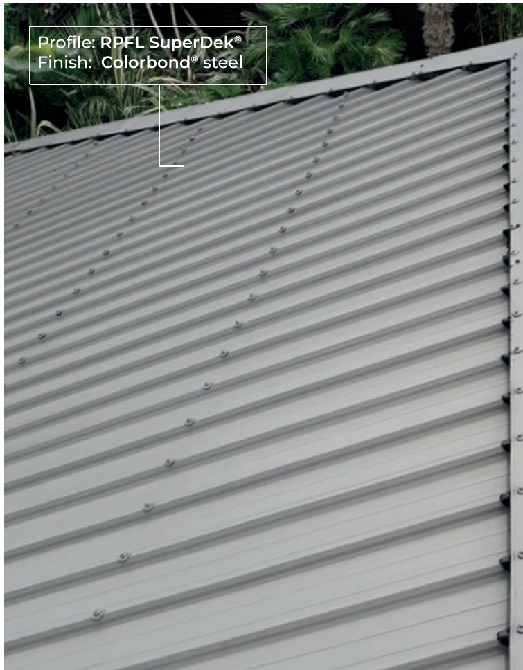
Profile: RPFL SuperDek® Finish: Colorbond® steel