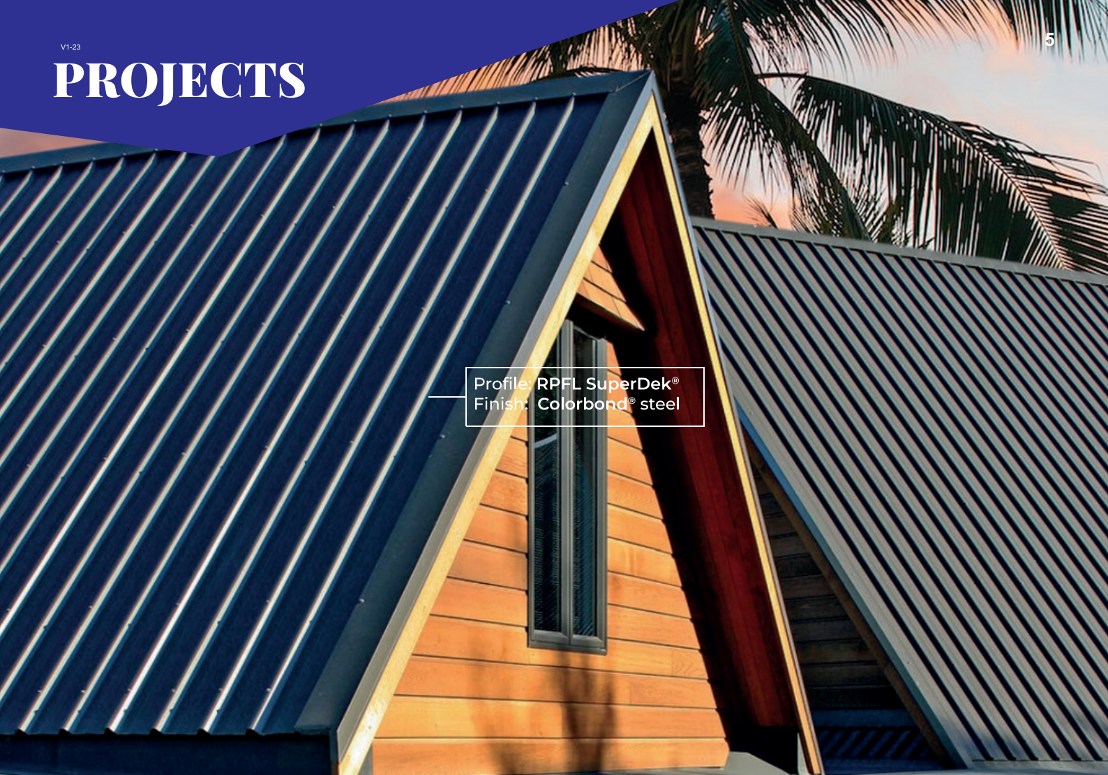
Profile: RPFL SuperDek® Finish: Colorbond® steel